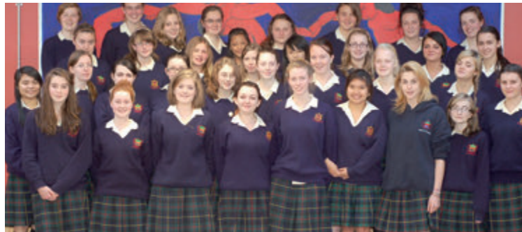
Rockford Manor Choir