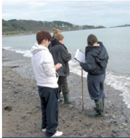
Geography Field Trip