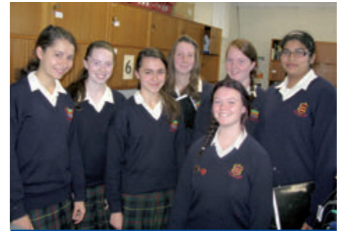
Public Speaking Team

This year’s Log on Learn computer course offered by TYP students to senior citizens started on October 13th - and here is a first reaction: