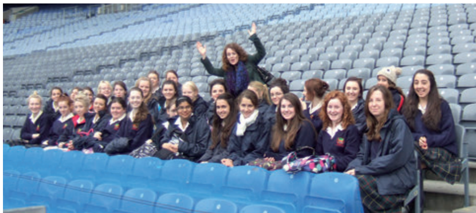
Transition Years In Croke Park

Last year's sponsored walk for Fundraising raised €1,372.40. €30 phone credit vouchers were given to the students who collected